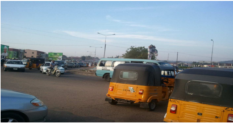
Figure 4: An image taken during the head counts of vehicles

Where W_{12} = T_{13} + T_{12} + T_{32} with the help of Math Lab