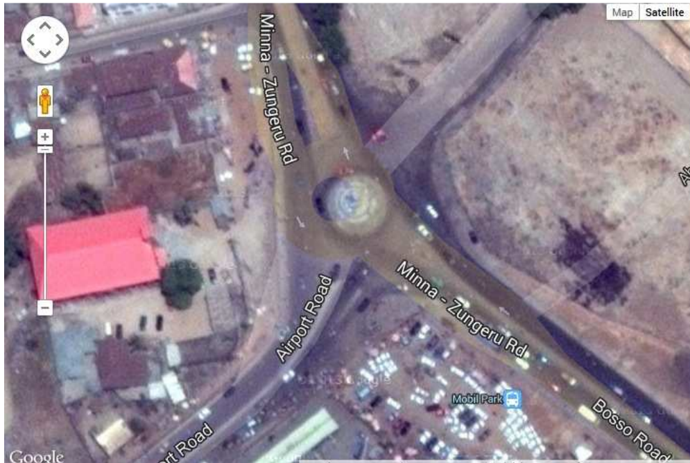
Figure 1: A Satellite Image of Mobil Roundabout along Zungeru Road

Note that W_{12} is equal to T_{12} + T_{13} + T_{32} while E_1 is equal to T_{12} + T_{13} . Here the required counts are E_1, E_2, E_3, L_1, L_3 and W_{12} (assuming that the missing flow counts for this case is L_2 ).